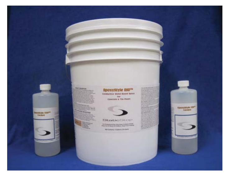
5-Gallon kit includes 5-gallon bucket and 2 pints of catalyst. Each 5-Gallon kit covers up to 2,250 to 3,000 square feet per coat. A minimum of two coats is recomended.

For detailed informantion, consult MSDS sheet.