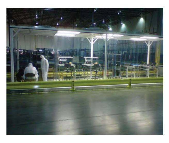
EpoxyStat ESD™ with DuraShield ESD™ Finish